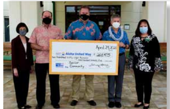
(Right) Kahala Nui made a generous donation to Catholic Charities Hawai'i and partnering non-profit organizations: Alzheimers Association, Kokua Kalihi Valley, Hawai'i Meals on Wheels, and Project Dana through Aloha United Way.