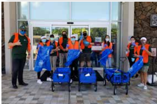
(Left) The CCH Adopt a Block team took to the streets of the Makiki neighborhood, home of our main Campus this Summer.