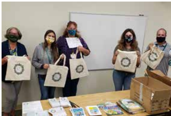
(Left) CCH's Kupuna to Kamali'i Program for Victims of Crime held a drive-up event for the Waianae community in the Spring.