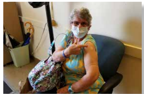
(Right) CCH's Lanakila Multi-Purpose Senior Center provided a site for COVID-19 vaccinations for seniors in partnership with the Kalihi-Palama Health Center.