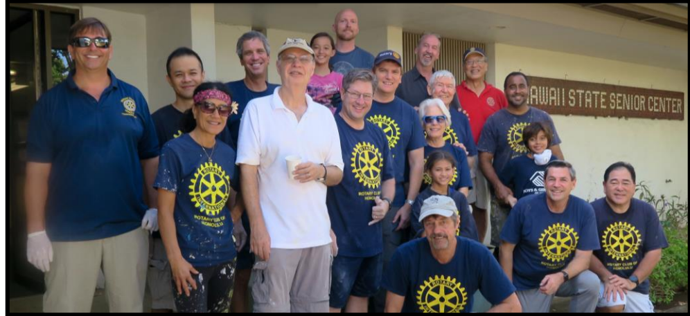
After plenty of hard work, and with some hard work still to do, our Seniors are very happy with the renovated room! Thank you Rotary Club!!!