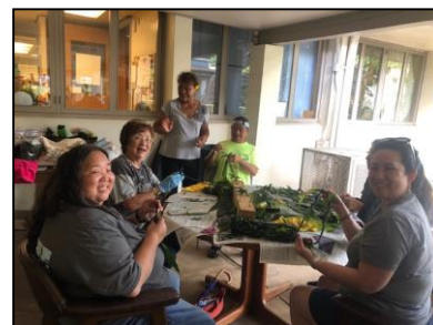
Members make lei all month long to assist in the Memorial Day efforts for the community.