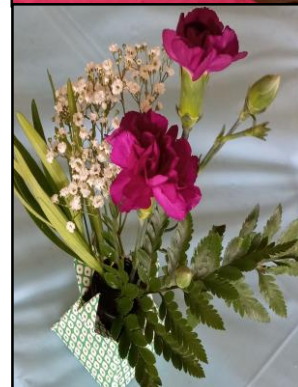
MOA Hawaii Children's Art Contest, which recognized public and private school children from kindergarten, first grade, second grade and fourth grade for their exemplary art work, as well as offered tea and making of beautiful flower arrangements for all those who attended.