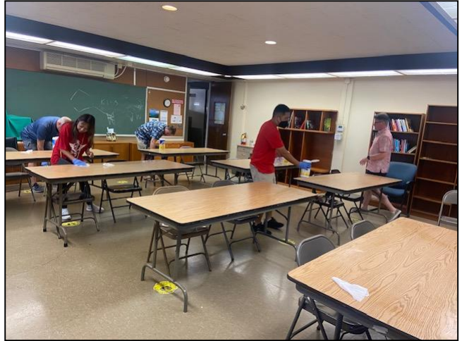
Marriott Hotels volunteers help sanitize and beautify the Lanakila Senior Center! So nice of them!!!