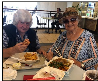
Portuguese Cultural Club members enjoying lunch at out Royal Hawaiian Shopping Center excursion last month.