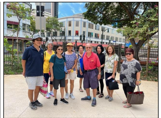
Members enjoying the Chinatown historic tour excursion with Hawaii Heritage Center volunteer guides.