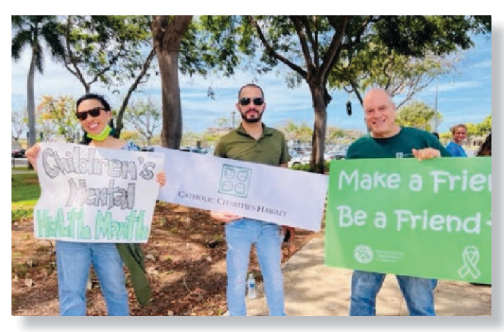
Children's Mental Health Awareness Month Sign Waving