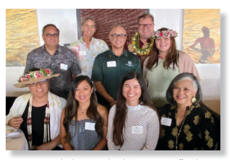
Kaua'i Leadership Council and CCH Kaua'i Staff at the 75th Anniversary Celebration