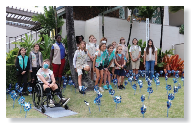
Blue Pinwheels Planted by Girls Scouts for Child Abuse Prevention Month