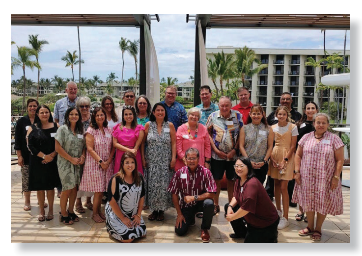
CCH Celebrates its 75th Anniversary at Waikoloa Beach, Hawai'i