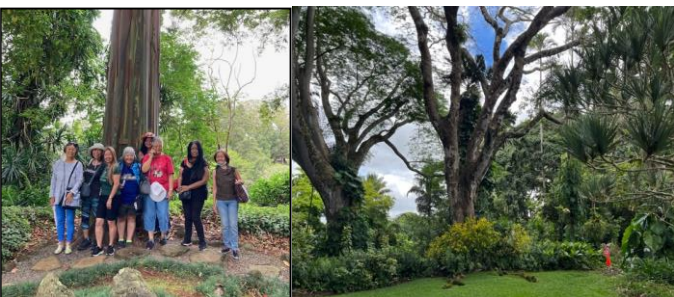
Wahiawa Botanical Gardens.