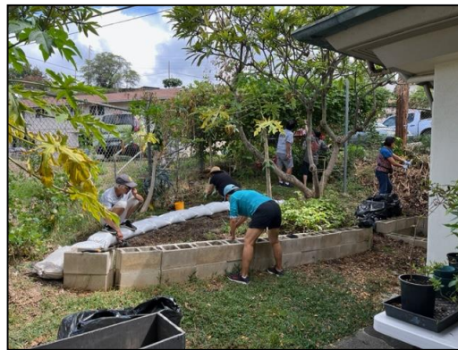
Raised Garden Beautification on July 8, 2023