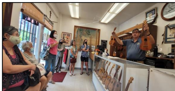
Members at the Kamaka Ukulele Excursion