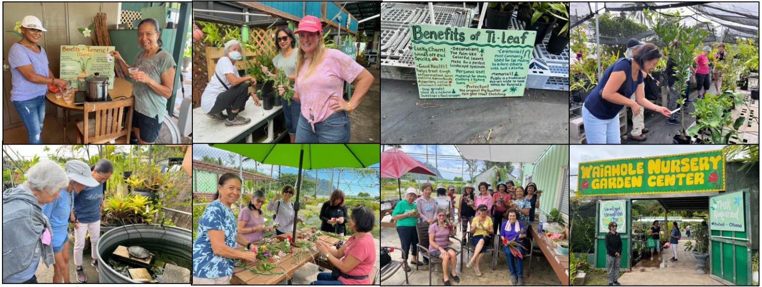
Making haku lei and enjoying other cultural connections at Waiahole nursery