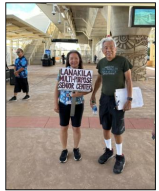
Rail Opening Day to the public.