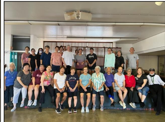
Stretch & Tone