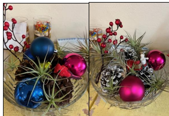
LMPSC members Amy Bratt and Atsuko Sakumoto make beautiful holiday arrangements using succulents