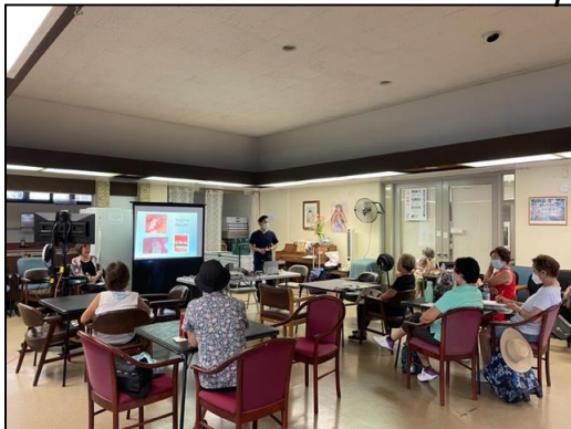
Oral Health Presentation.