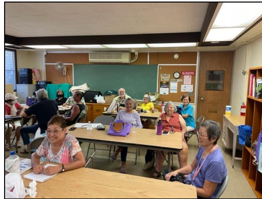
Digital Technology w/ Lanakila Pacific