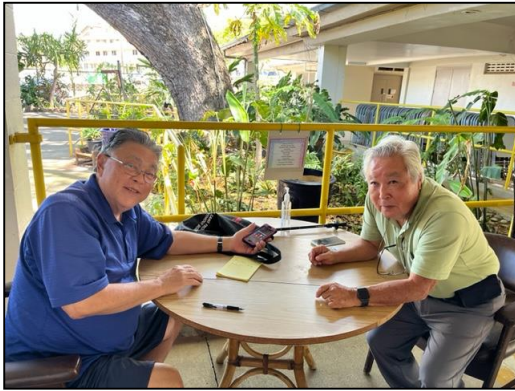
Beginner iPhone 1:1

Some of our classes and clubs saying "Merry Christmas" to all!