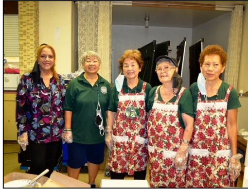
Special Events Group