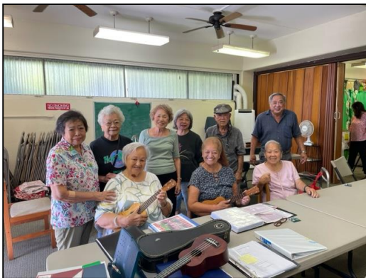
Happy Senior Serenaders