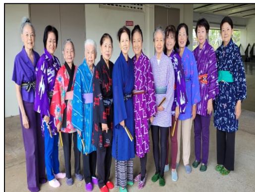
Okinawan Dance "Wishing you all of you a very Happy Holiday Season"