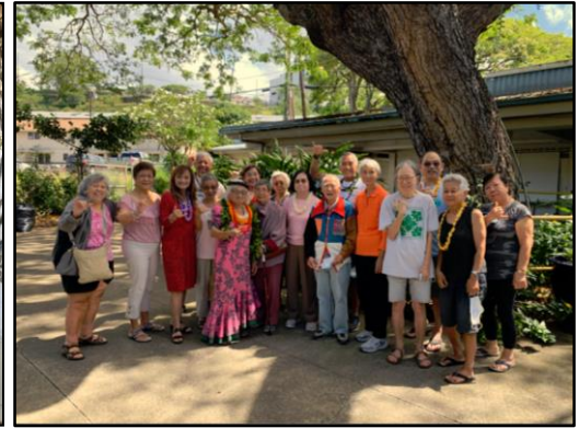
Chinese Cultural Club