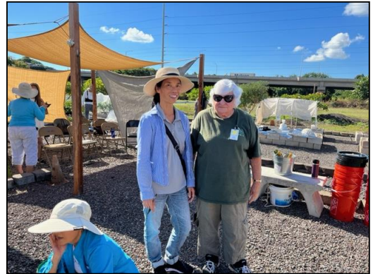
Learning in the sun at the Urban Center Excursion.