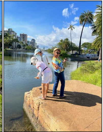
Our members enjoying throwing the genki balls into the Ala Wai Canal.