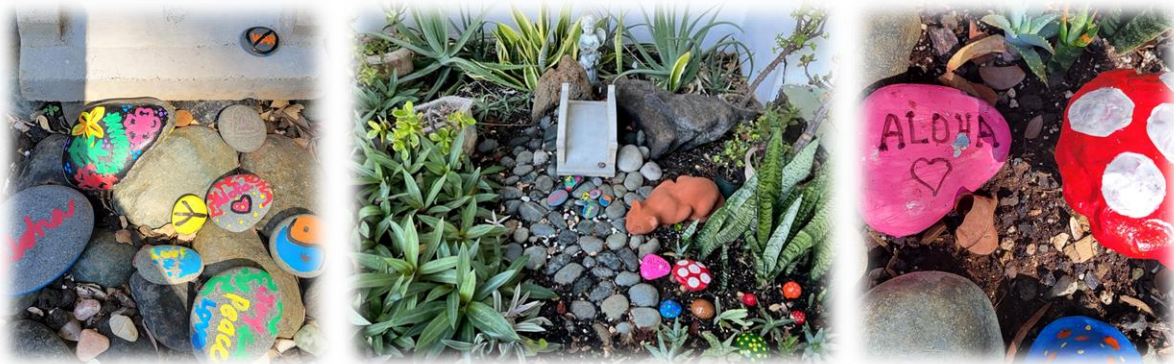
Lanakila's Peace Garden