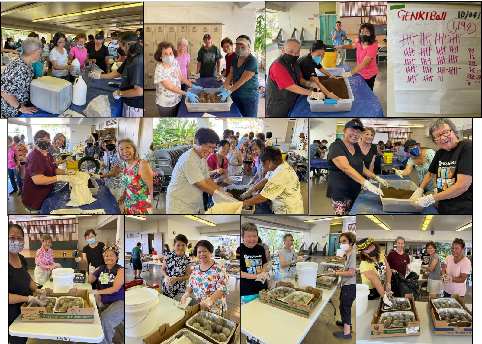
Preparing the genki balls.