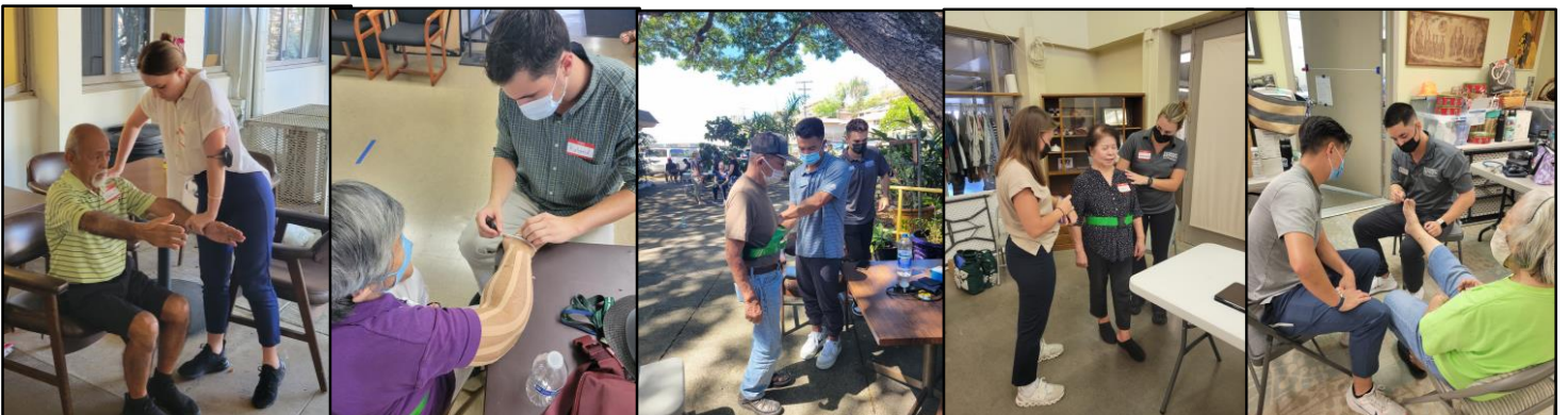
Doctor of Physical Therapy Lab students from HPU practice their skills on our members.