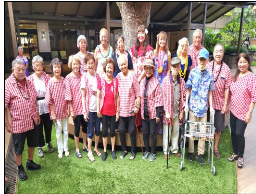
Happy Senior Serenaders