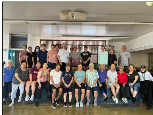
Stretch & Tone