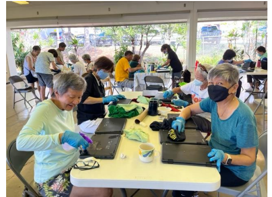
Preparing the genki balls.