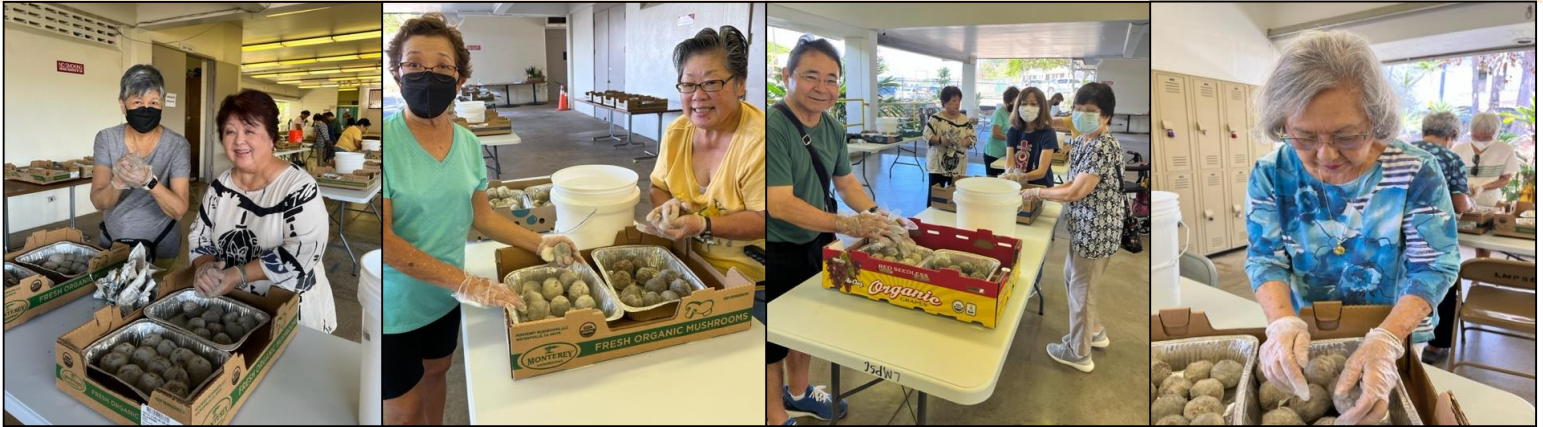
Preparing the fuzzy Genki Balls