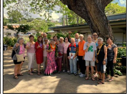
Chinese Cultural Club