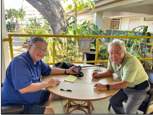
Beginner iPhone 1:1

Some of our classes and clubs saying "Happy Thanksgiving" to all!