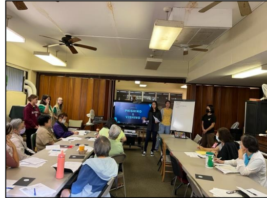
Cyber Safe Inc. made up of Punahou School students and members of the Girl Scouts of Hawaii did an informative Cyber Safety Presentation on Saturday, January 13, 2024, for Lanakila seniors. We express much gratitude to the students for a job well done!