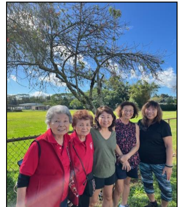
Members pose near a Sakura tree at our Sakura Tour excursion.