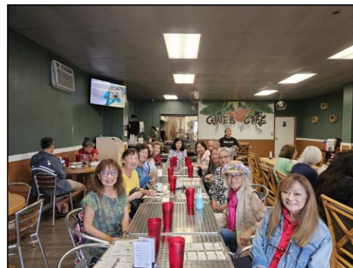
Members enjoy a nice lunch after viewing the beautiful sakura in Wahiawa. Mahalo CCH Transportation program for the tour!