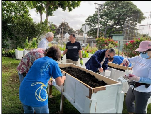
Rotary Club of West Honolulu's raised garden service project.