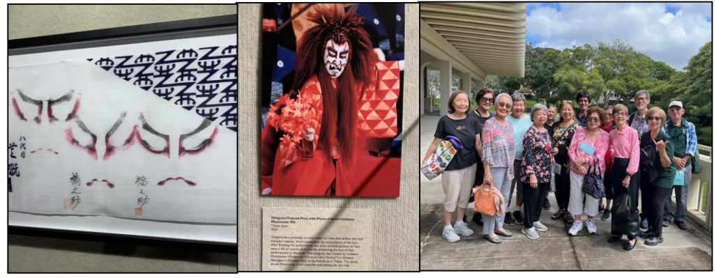
Kabuki in Hawaii Display at the East-West Center. She notes, "One of the interesting parts of the exhibit was how they would press their heavily made up Kabuki faces into a silk cloth, leaving a permanent record".