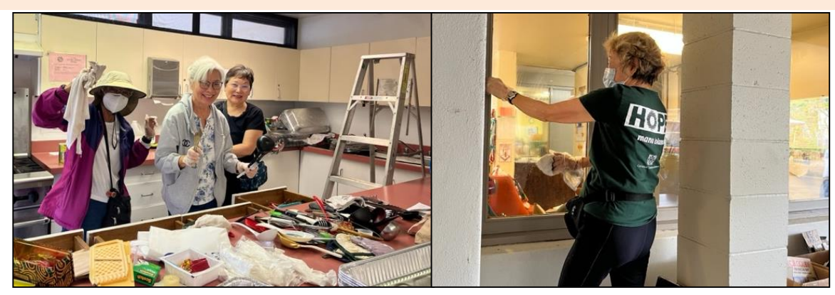
Spring Cleaning Beautification Project