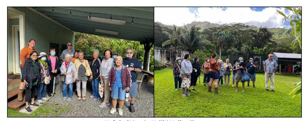
Ho'olu 'Aina in Kalihi Valley Tour.