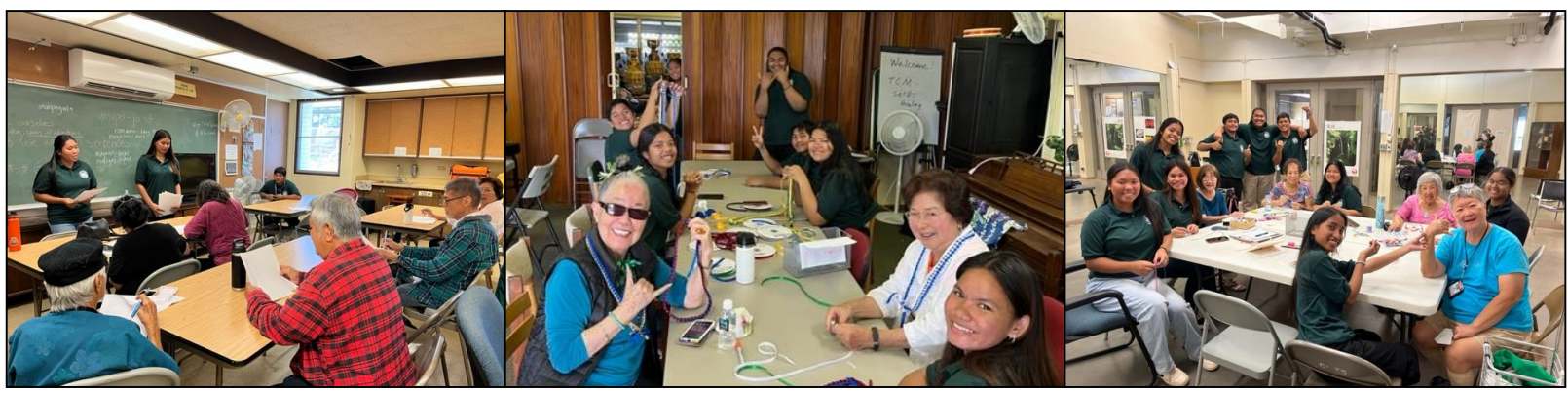
Waipahu High School Community Health Workers conducting a variety of classes for our seniors including Tagalog language classes, technology help desk, friendship bracelet and ribbon lei-making workshops, ukulele, and more!