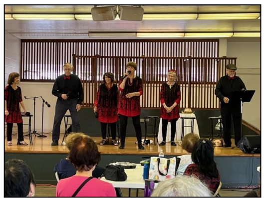
Silver Foxes Performance