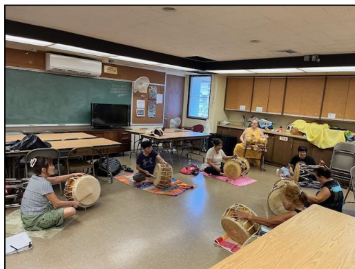
Learning Salmunori, a Korean percussion class, at Lanakila Senior Center.