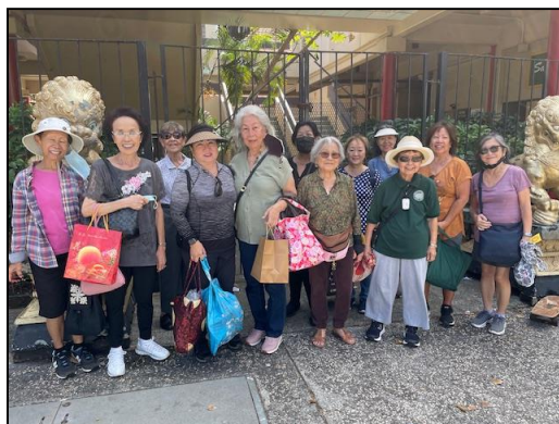
Lanakila Senior Center members enjoying a tour of Chinatown with the Hawaii Heritage Center.