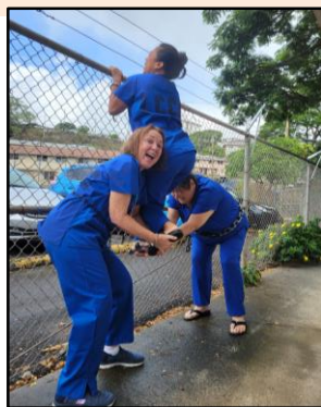
Some Halloween fun by a few inmates (staff) Haha!