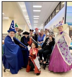
"The Sing For Your Life class wishes you and yours a happy, healthy, heart-warming Holiday Season!"