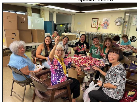
Lanakila seniors sewing beautiful flower lei for our veterans.