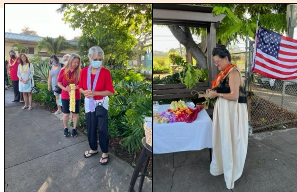
55 th Anniversary blessing of our Center.