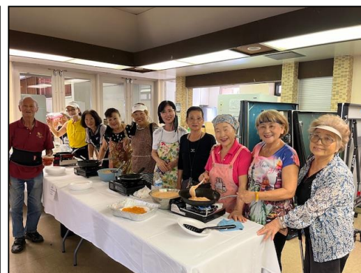
Korean Cultural Club making delicious authentic Korean food at Lanakila Senior Center.