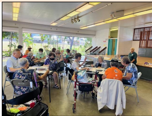
Playing BINGO together once a month at Lanakila Senior Center.