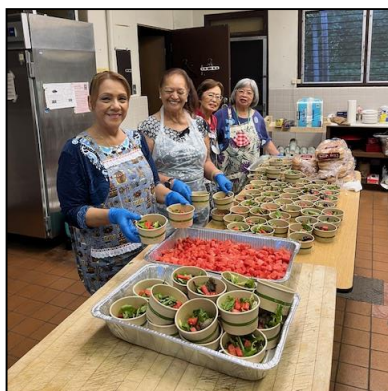
Preparing salads at a special event at Lanakila Senior Center.