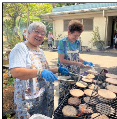
Enjoying a 4th of July Barbecue at Lanakila Senior Center.