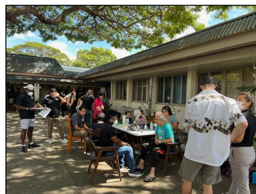
Hawaii Pacific University Physical Therapy doctorate students learning how to work with Lanakila Seniors being their "patients".