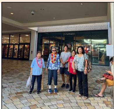
Walk and Shop at Ala Moana Center