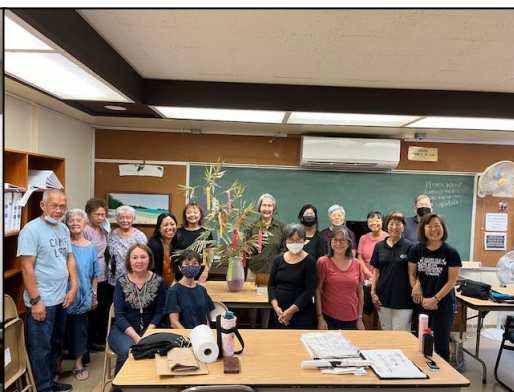
Tanzaku arrangement gifted to the Center by the Japanese Calligraphy class to commemorate our 55 th Anniversary.