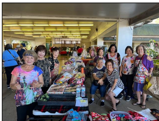
Lanakila's Needle and Thread Class selling beautiful blankets, dish towels, pot holders and other cool items at Show and Sell.