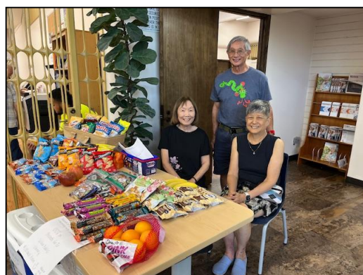
Lanakila Seniors helping raise funds for programs at Liliha Public Library with Friends of Liliha Library.