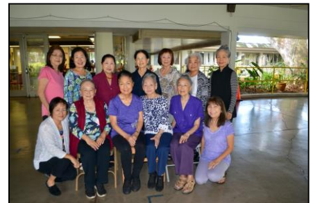
"We wish all of you a very happy holiday season. Merry Christmas". Aloha from the Okinawan Dance Class.