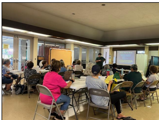
Taking a food safety class conducted by State Department of Health at LMPSC.