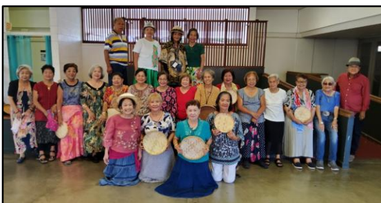
"Our Filipino Club ohana wishes each and every one a VERY MERRY CHRISTMAS and A PROSPEROUS NEW YEAR 2025.