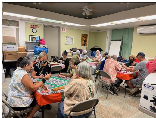
Playing Mah Jong weekly at Lanakila Senior Center.