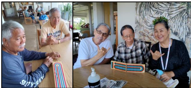
"We are thankful for the opportunity to socialize! Happy holidays!" " from Cribbage class.