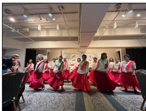
Filipino Cultural Club performing at a special community event.