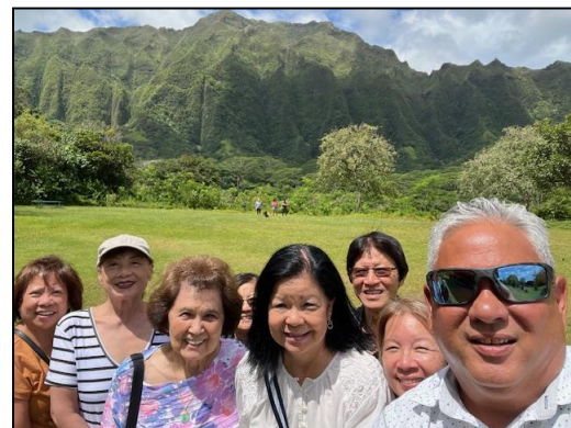
Enjoying an excursion to Ho'omaluhia Botanical Gardens.