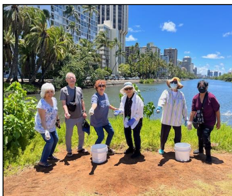
Tossing Genki Balls into the Ala Wai Canal! Genki Hou!!!