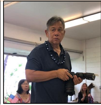
Evan Ching, our fave photographer! Photo submitted by Walt Miyashiro.