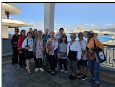
Lanakila members enjoyed the beautiful blue ocean and sky, the luxury ship behind them, the Honolulu Star Cruise Ship, and delicious lunch at Spaghetti Factory together.