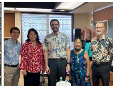
Financial Advice Pop-up held on Friday, 3/21/25. Mahalo to all the financial professionals who gave of their time to help LMPSC members.