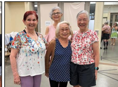
Tap Dance Class enjoy time together.