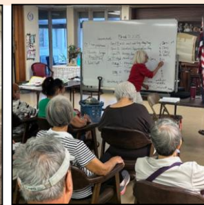
Chinese Cultural Club reviews the event schedule.