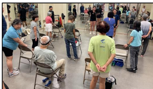
HPU Physical Therapy Doctorate Students teach a series of Strength and Balance classes.