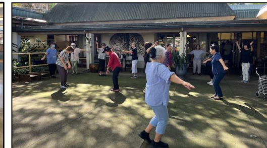
Yui Bujo Class practice in the senior center's courtyard.