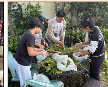
Waipahu Students harvesting vegetables from our garden to give to center members.